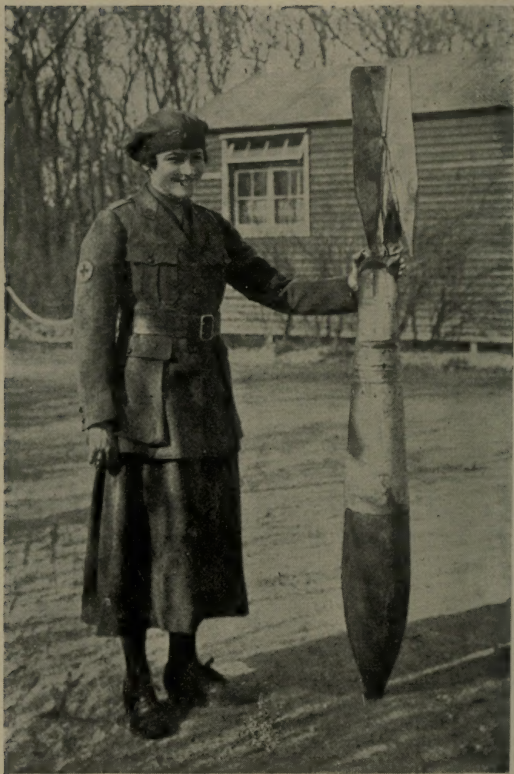
A "F.A.N.Y." with the aerial torpedo dropped into the Camp.